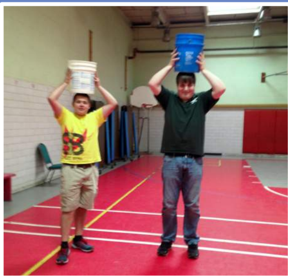
Boys Practicing Carrying Water at a School Assembly

It has been wonderful to be in the US and reconnect with so many of you who have been faithfully supporting us. I have had a busy schedule, including traveling to North Dakota, Michigan, Texas, South Carolina, and Pennsylvania. Our family has felt deeply loved and appreciated, as we have visited various places. All of you are so dear to our hearts, and we have been grateful for the opportunity to share what God has been doing in Uganda through all of our efforts.